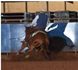
Open - Playin Motown & Ben Baldus