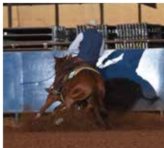
Open - Playin Motown & Ben Baldus