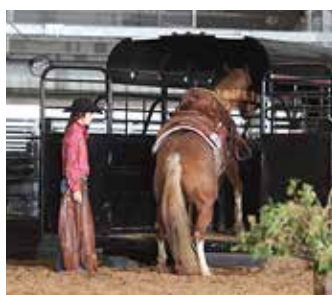
Youth - Jordan Cheek & SLJ Navijuice